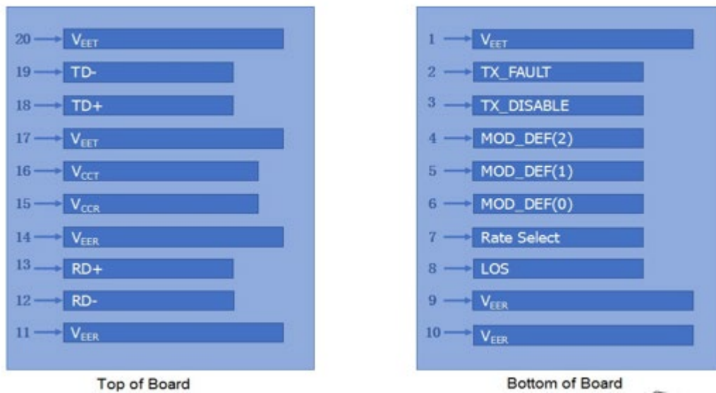
Pin-out of connector Block on Host board