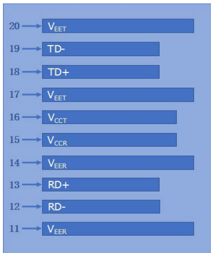
Top of Board